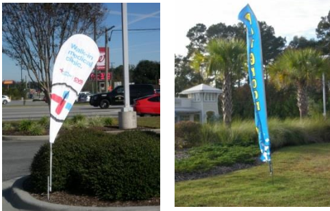
Examples of Feather Banners

Feather banner means a banner mounted on a pole, such as the examples shown to the right. Such signs may be wind activated (see “animated sign”) or rigidly mounted in a stationary position.