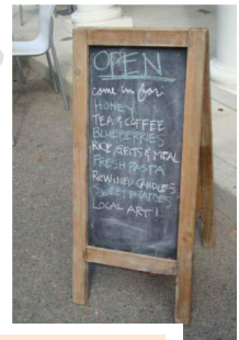
A frame sign

Sign means any object, device, display or structure, or part thereof, situated outdoors or indoors, which is used to advertise, identify, display, direct or attract attention to an object, person, institution, organization, business, product, service, event or location by any means, including words, letters, figures, design, symbols, fixtures, colors, illumination or projected images. The term sign includes banners, posters, inflatable signs, tethered balloons and pennants. Other signs to possibly define: banner, billboard, building, changeable copy sign, double-faced, electronic, freestanding, ground, illuminated, inflatable, LCD, LED. Multiple message, flag, pennant, pole or pylon, projecting, roofline, swinging, tri-vision. wall-face, yard sale, etc.).